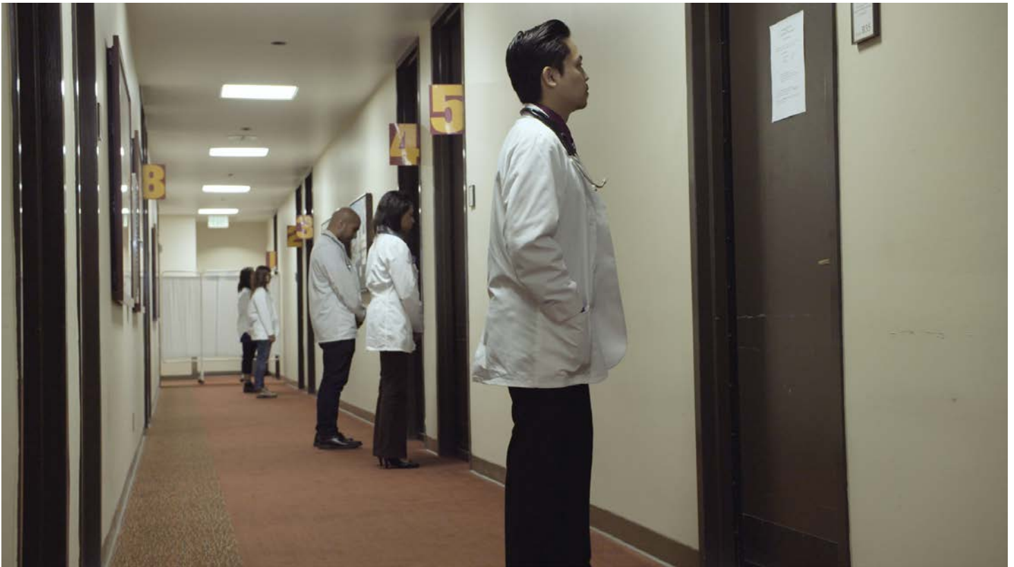
Kerry Tribe. Standardized Patient , 2017 (production still). Commissioned by SFMOMA. Courtesy the artist and 1301PE, Los Angeles. © Kerry Tribe.

The first scene shows the medical students standing in a hallway, each of them outside a door to an examination room. Over the course of the video, a viewer learns about four patients: a thirty-six-year-old woman in a sharp black suit who is following up on blood work for chest pains and constantly looking at her watch, anxious to get back to work; a seventy-two-year-old woman whose daughter insisted she get a checkup after repeated incidents of forgetfulness; a teenage girl who recently became sexually active and wants contraceptives but agrees to being screened for sexually transmitted infections (and the results aren't good); and a sixty-eight-year-old man near death.