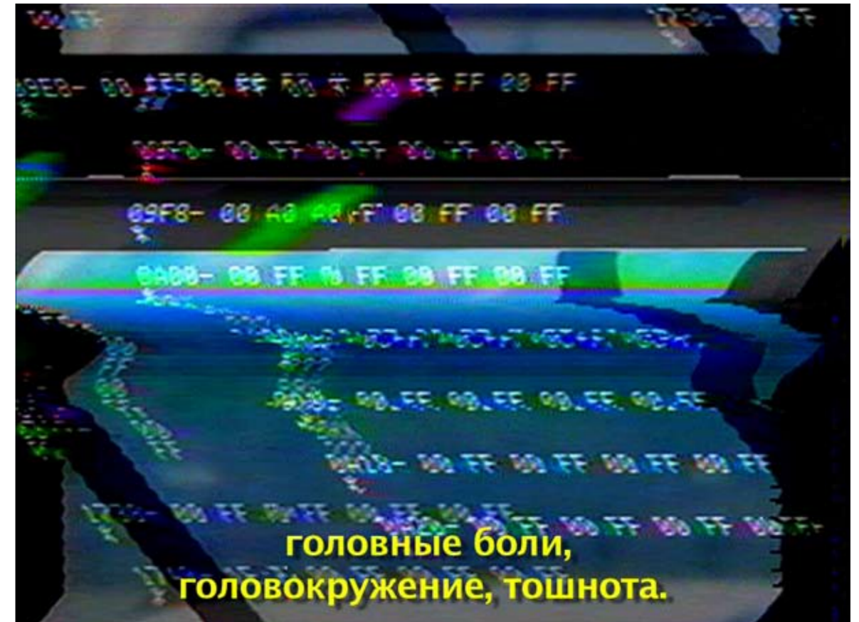
The Last Soviet (still), 2010