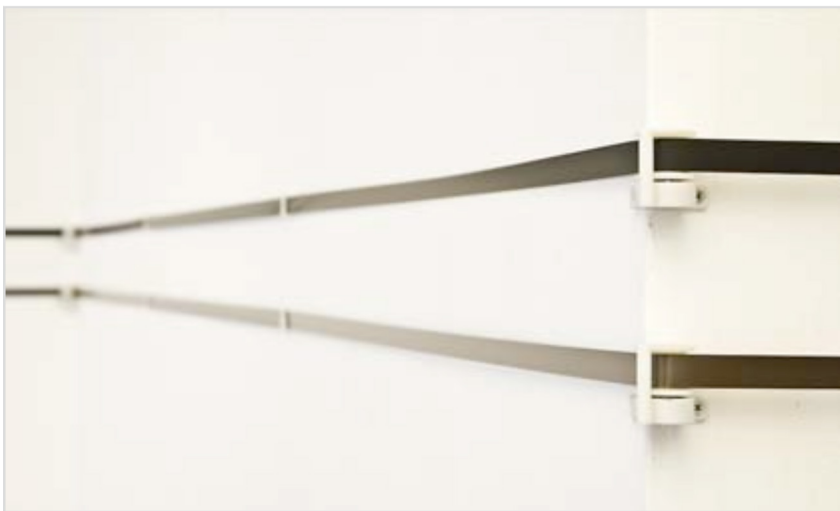
Kerry Tribe, Milton Torres Sees a Ghost (detail), 2010. Installation view: Arnolfini

Tags: London, contemporary, Moving Images, archive film, experimental, Sound, fighter, space, ufo, space flight, insect, 20th century (1901 - 2000)